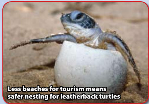
Less beaches for tourism means safer nesting for leatherback turtles